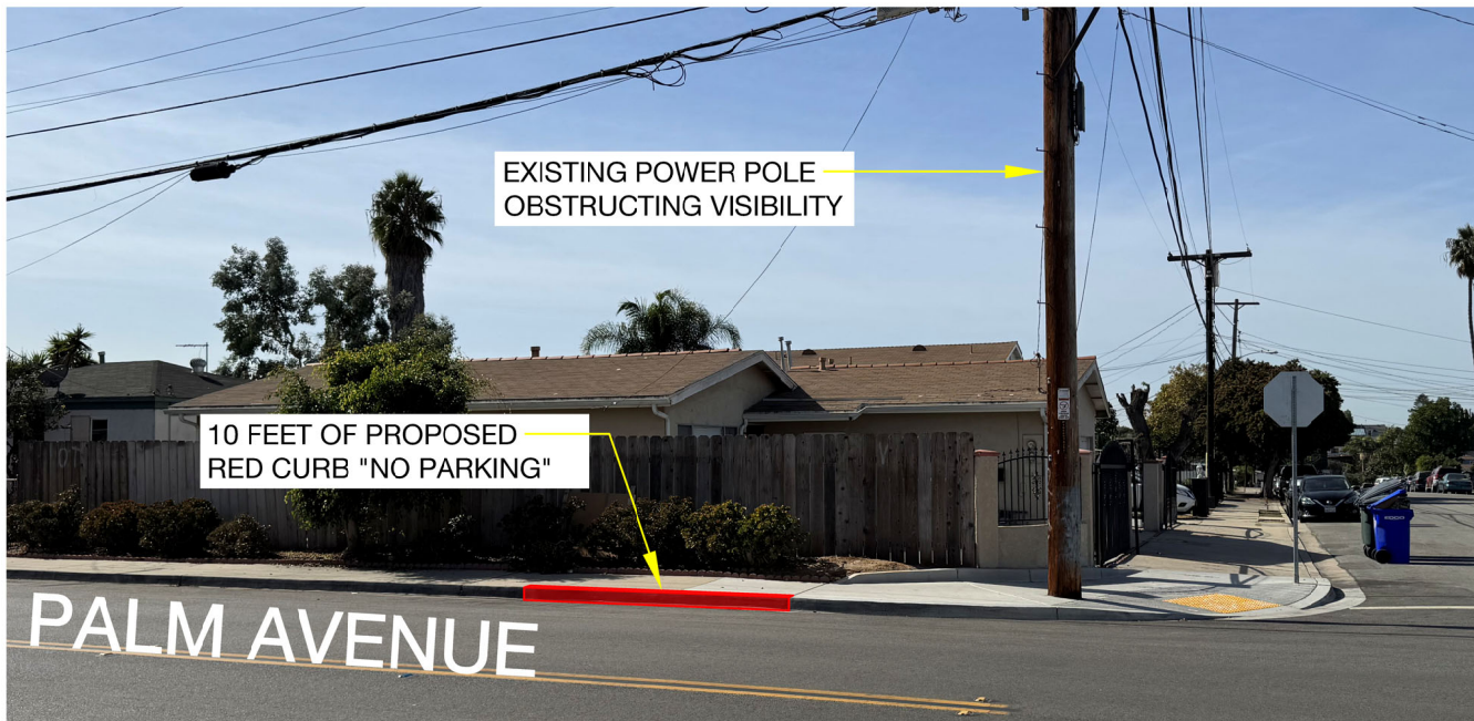
Location of Proposed Red Curb "No Parking" on the west side of Palm Avenue, south of E. 17th Street (looking southwest)