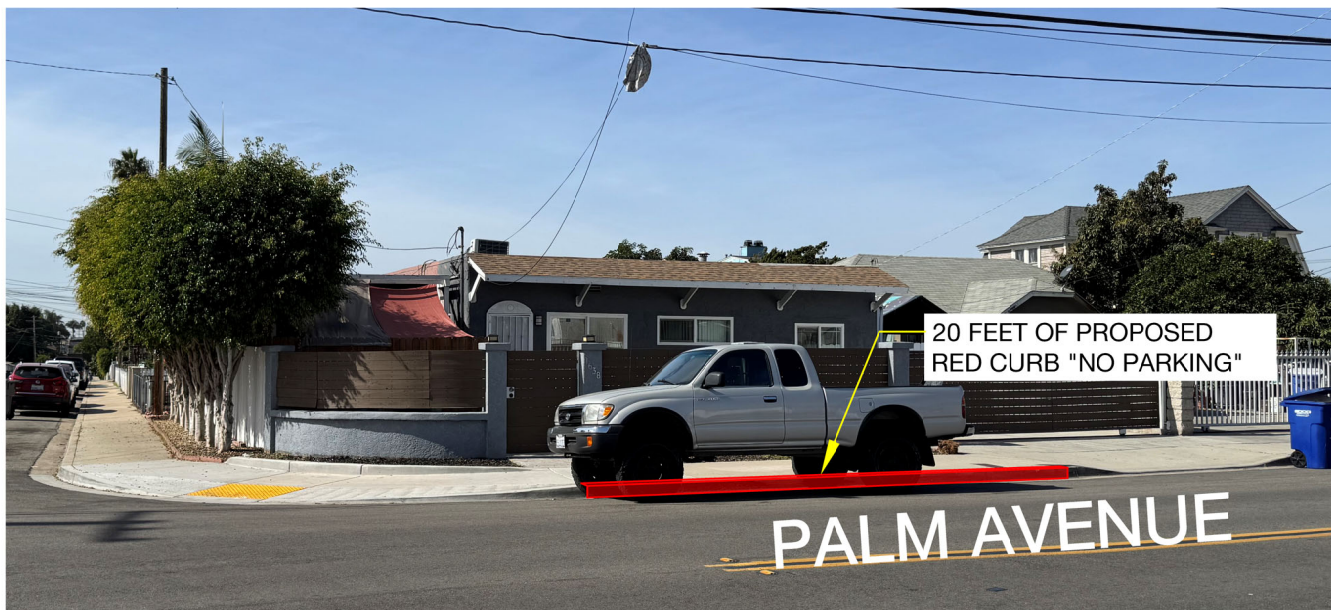
Location of Proposed Red Curb "No Parking" on the west side of Palm Avenue, north of E. 17th Street (looking northwest)