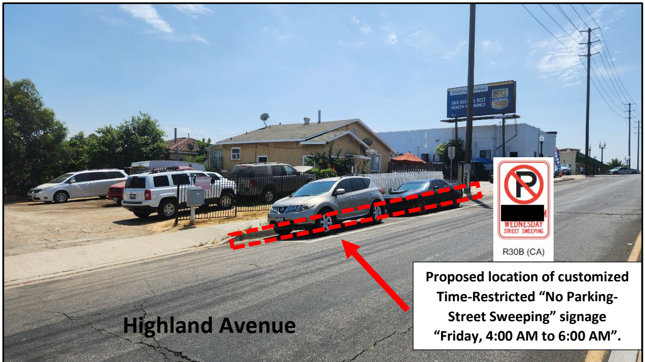
Location of proposed time restricted "No Parking Street Sweeping" signs (looking southeast)