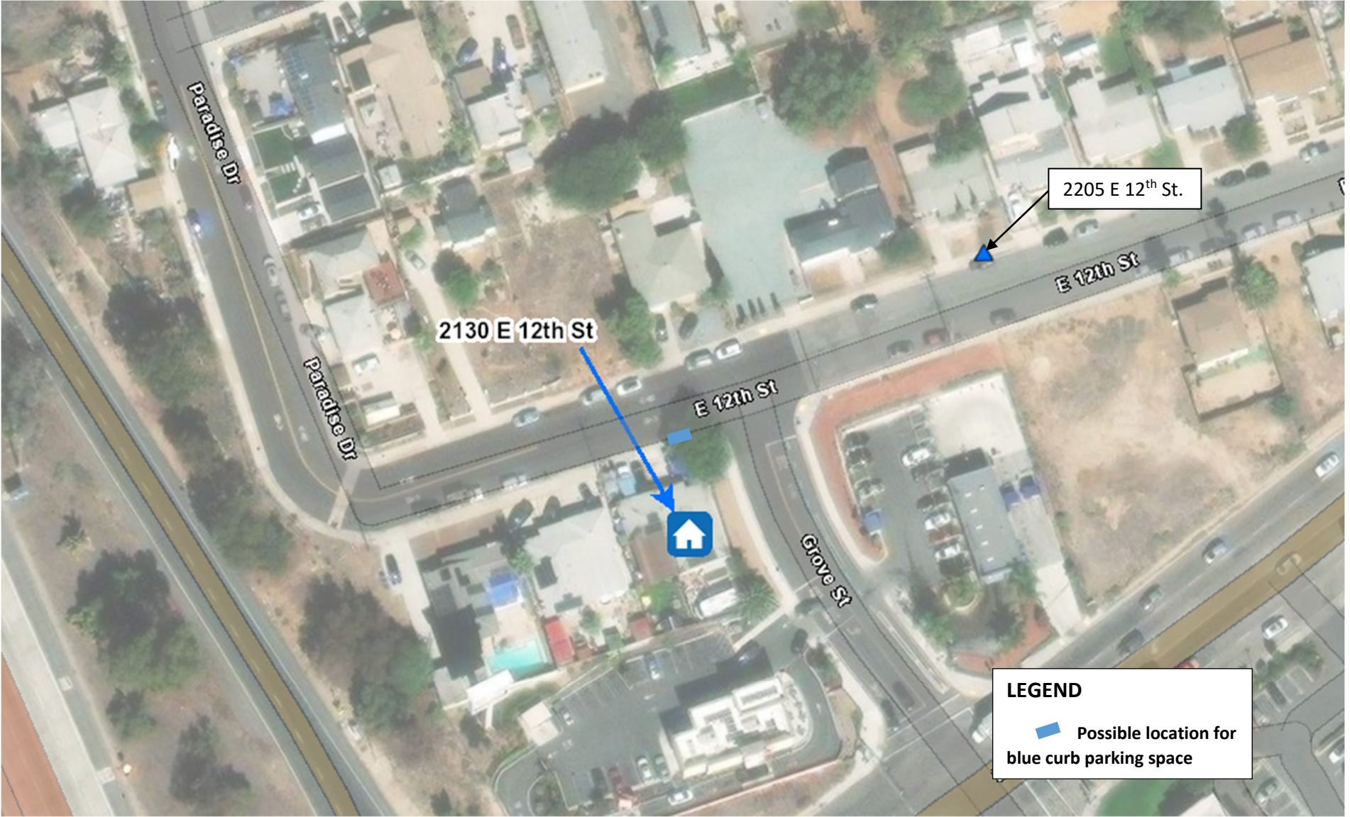
Exhibit B: Location Map Showing Existing Blue Curb Parking Space (TSC Item: 2024-01)