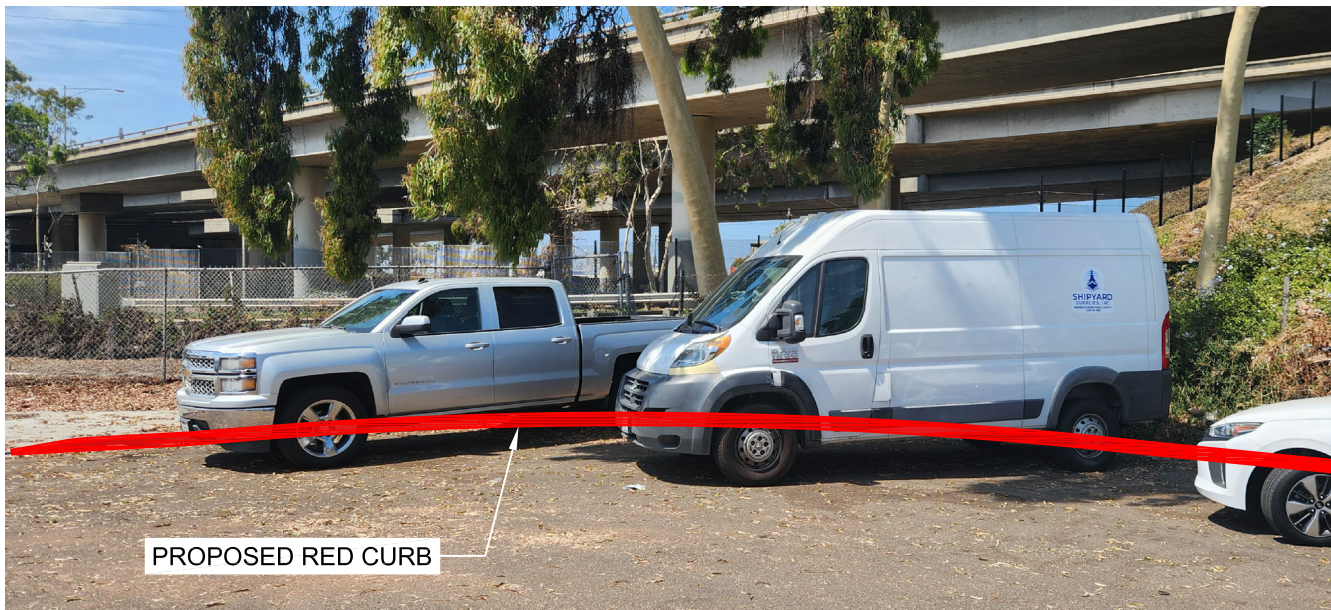
Location of proposed Red Curb at cul-de-sac (looking southwest)