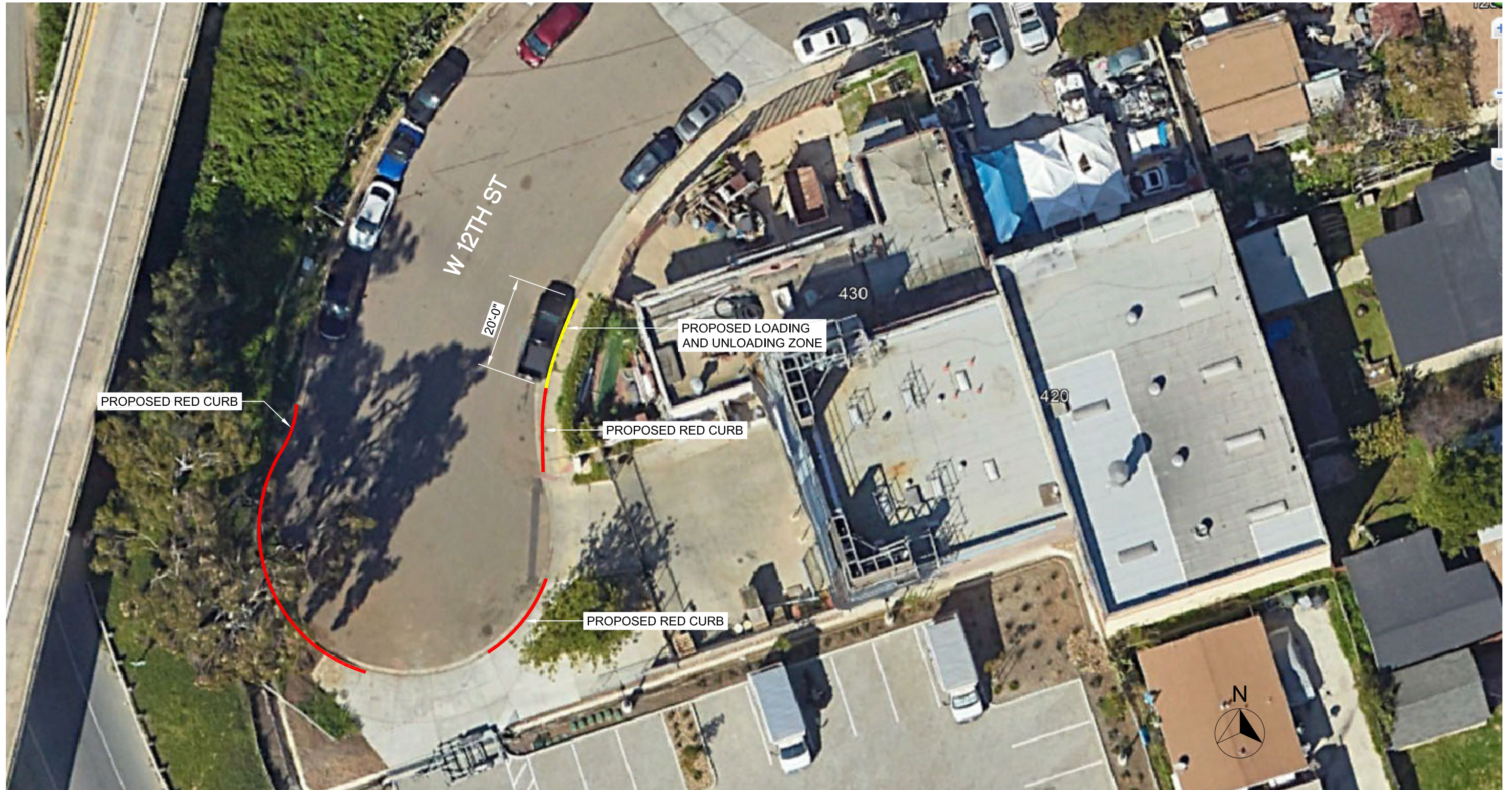
Exhibit A: Location Map with Recommended Enhancements (TSC Item: 2024-07)