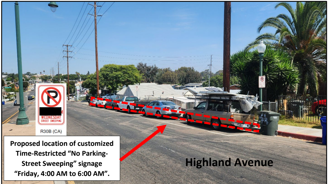
Location of proposed time restricted "No Parking Street Sweeping" signs (looking northeast)