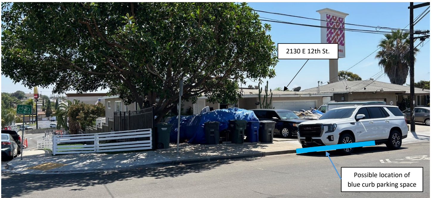
Possible location of blue curb disabled persons parking space in front of 2130 E. 12th Street (Looking Southwest)