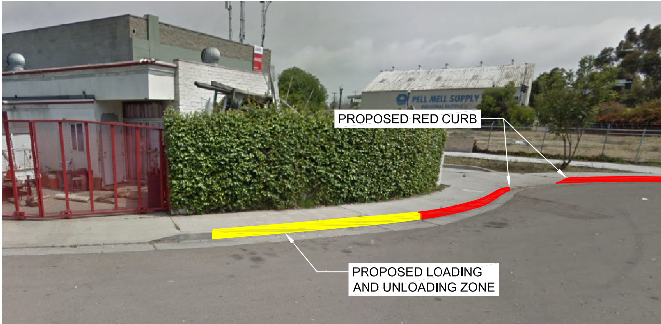
Location of proposed Loading and Unloading Zone (looking southeast)