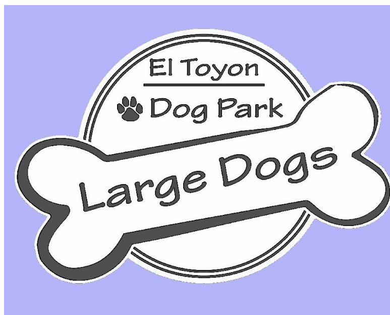
Fig. 1.2 Large Dogs Sign