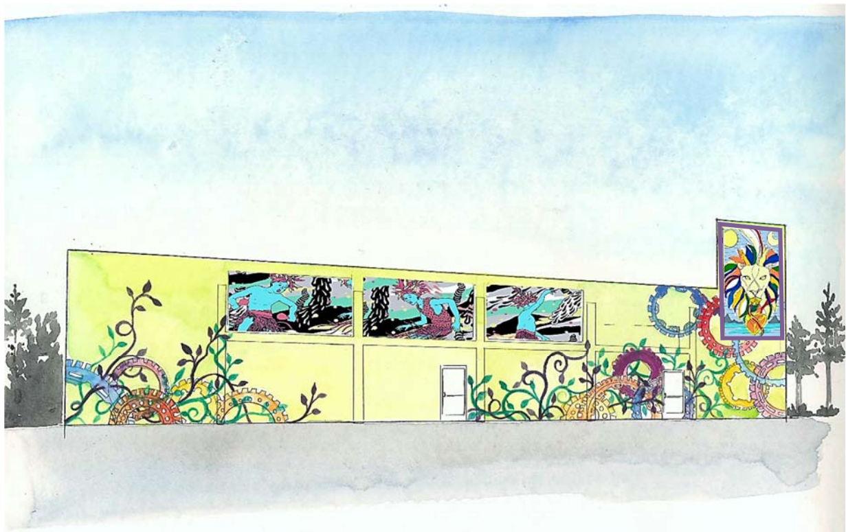
H&M Goodies Family Auction House PROPOSED East Façade