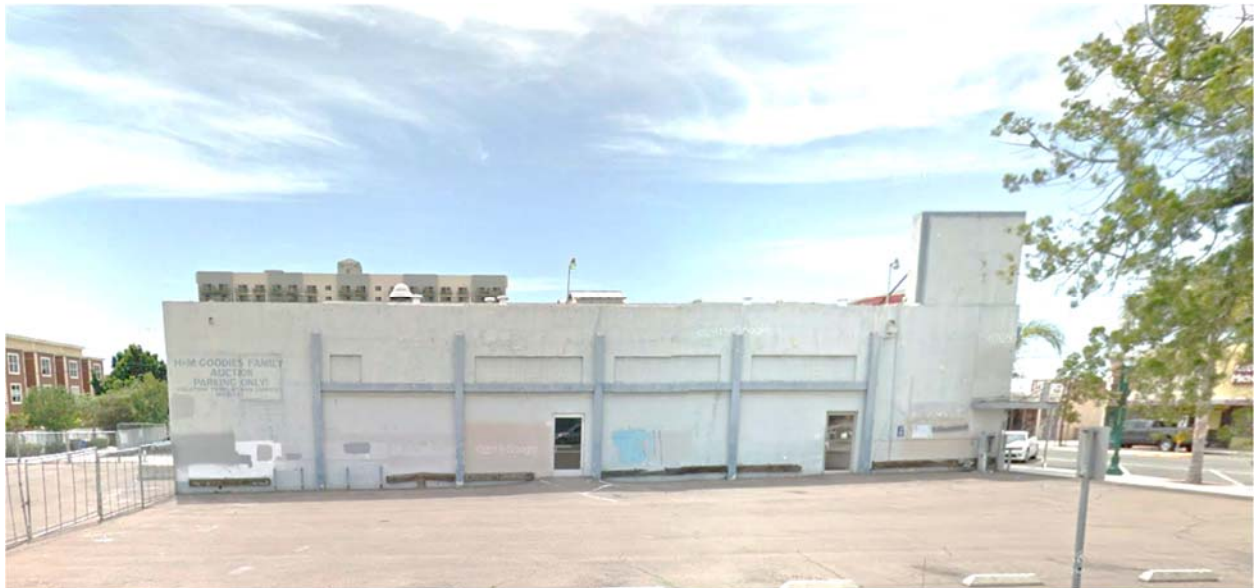
H&M Goodies Family Auction House East Façade

200 E 12 th Street National City, CA 91950 Phone: 619.297.2787 Web: www.areasonstosurvive.org