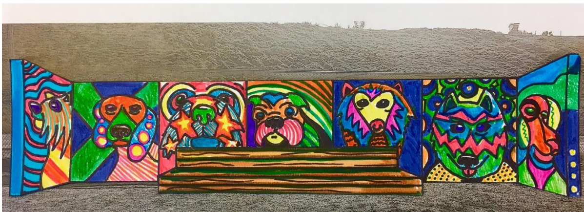
Fig. 1.3 Proposed mural at El Toyon Park

ARTS artists and students will collaborate with the National City community to create bright murals in the dog park Area.