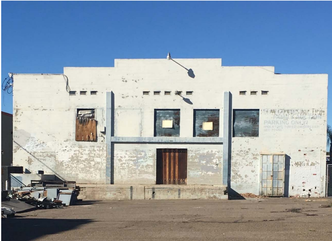
H&M Goodies Family Auction House back Façade

200 E 12 th Street National City, CA 91950 Phone: 619.297.2787 Web: www.areasantosurvive.org