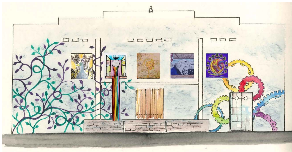
H&M Goodies Family Auction House PROPOSED back Façade