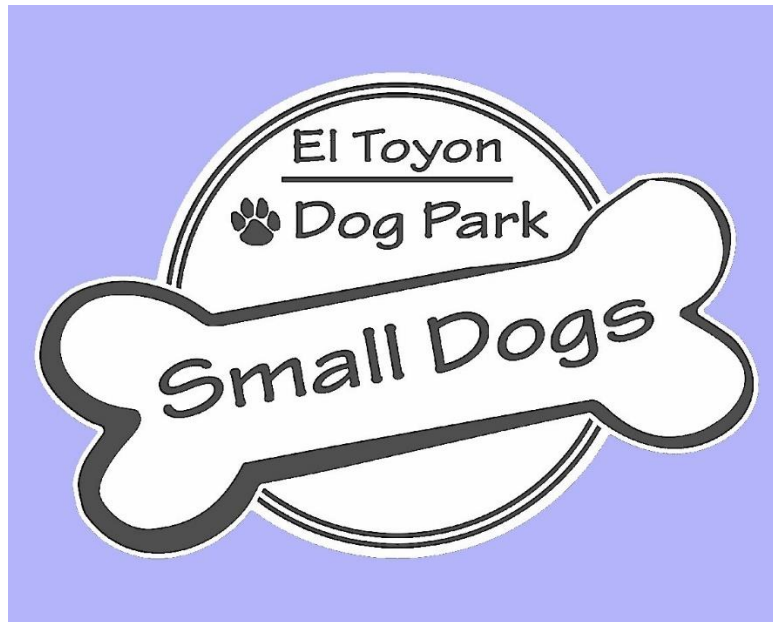
Fig. 1.2 Small Dogs Sign

ARTS will create 2 dog signs, utilizing a UV stabilized HDPE laminate, a standard in playground construction and park signage material.