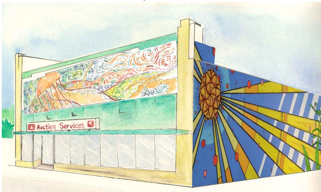
H&M Goodies Family Auction House PROPOSED front Façade