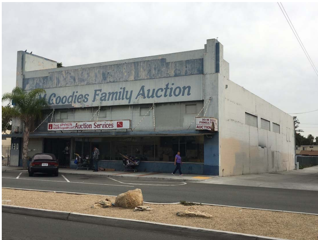
H&M Goodies Family Auction House front Façade

200 E 12 th Street National City, CA 91950 Phone: 619.297.2787 Web: www.areasonstosurvive.org