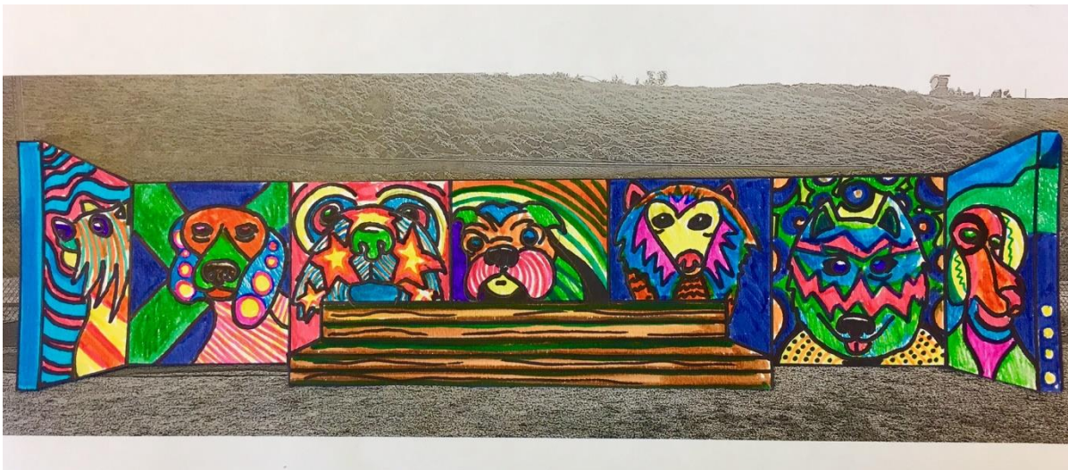
Fig. 1.1 Proposed Mural for El Toyon Dog Park

A Reason To Survive (ARTS), in collaboration with the City of National City and the National City community; will design and create 2 dog park signs and 2 murals for El Toyon Dog Park.