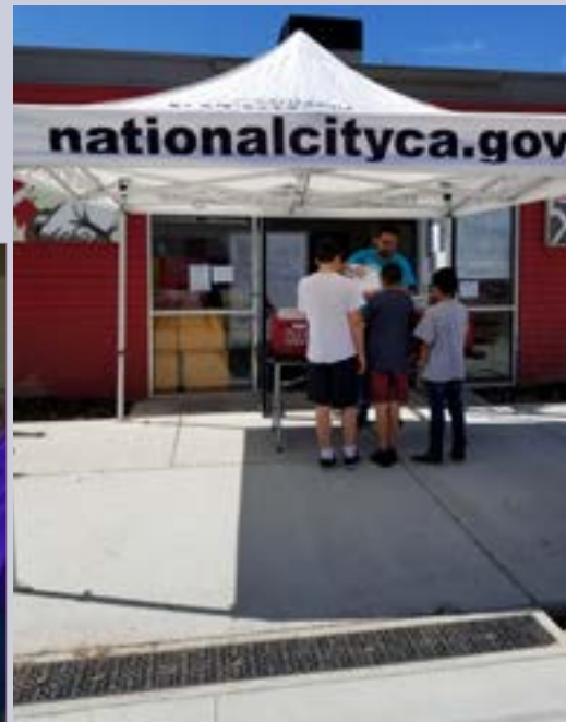
*some pictures were taken before it was mandatory to wear face coverings