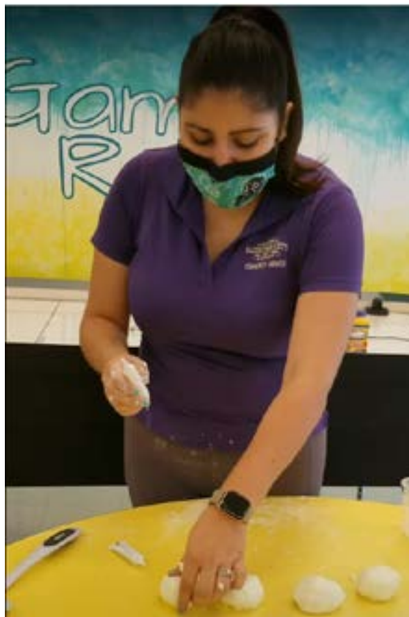
To Learn how to make cloud dough and more click here .