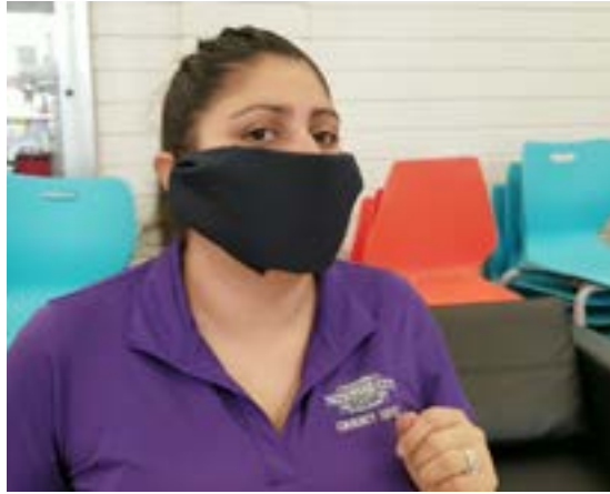
Click on the picture to view the video

Congratulations you just made your first face mask! A video tutorial is also available on our city Youtube channel .