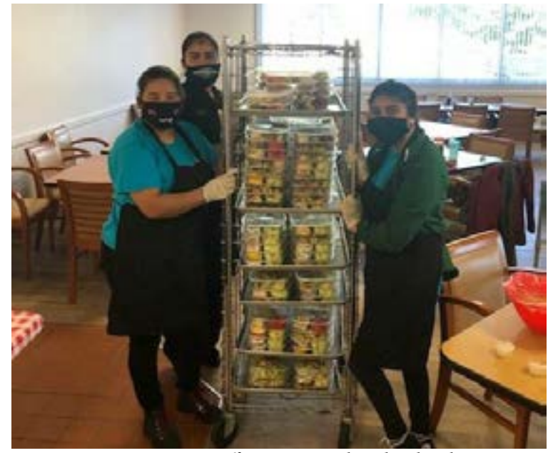
Nutrition center staff preparing grab and go lunches