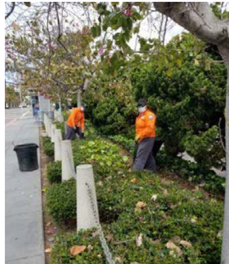
Public Works keeping our city clean.