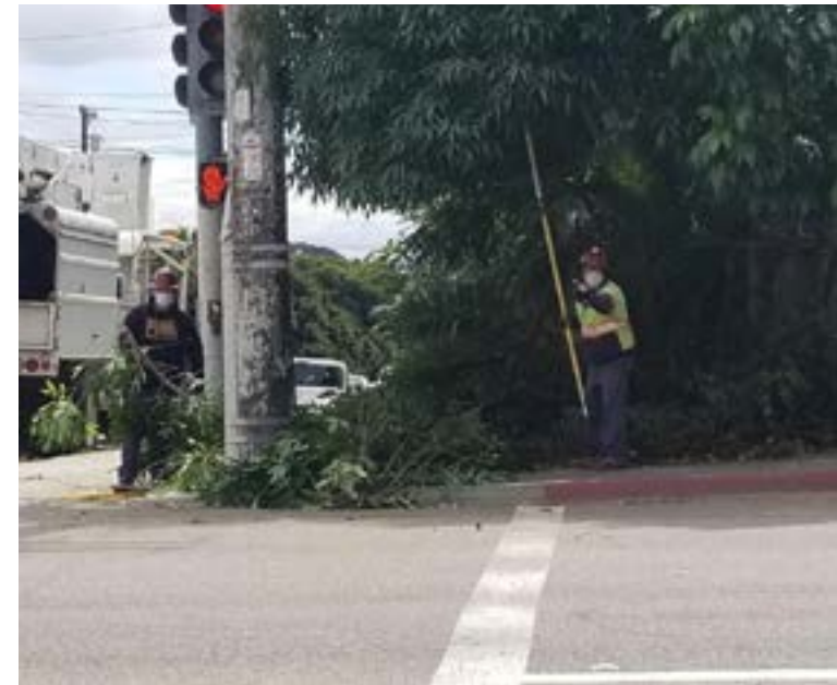
Public Works Trimming trees throughout the city