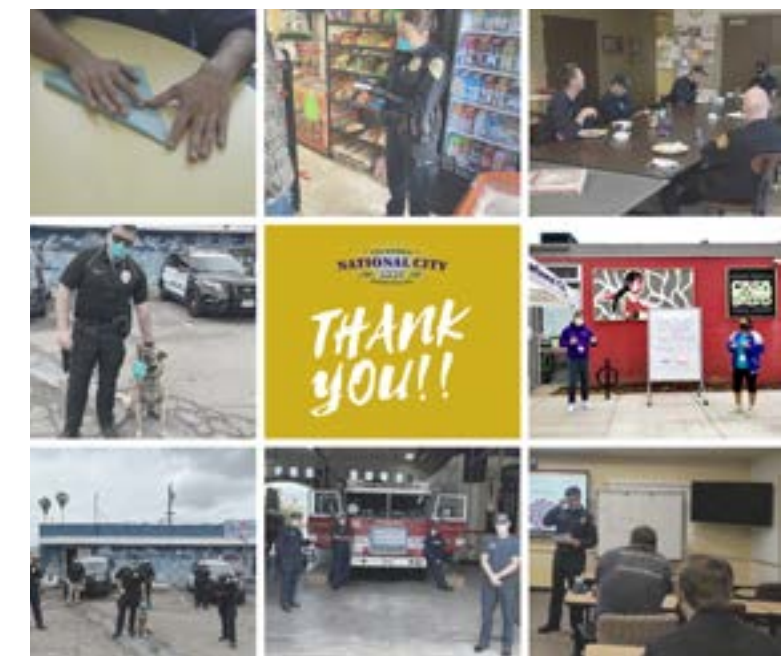
Thanks to all our first responders and essential staff.