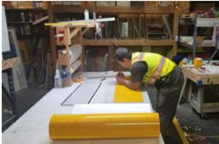
Public Works staff hard at work