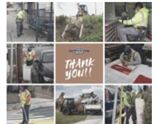
Thanks to all city employees

72 hr Red zones White zones Blue zones Green zones