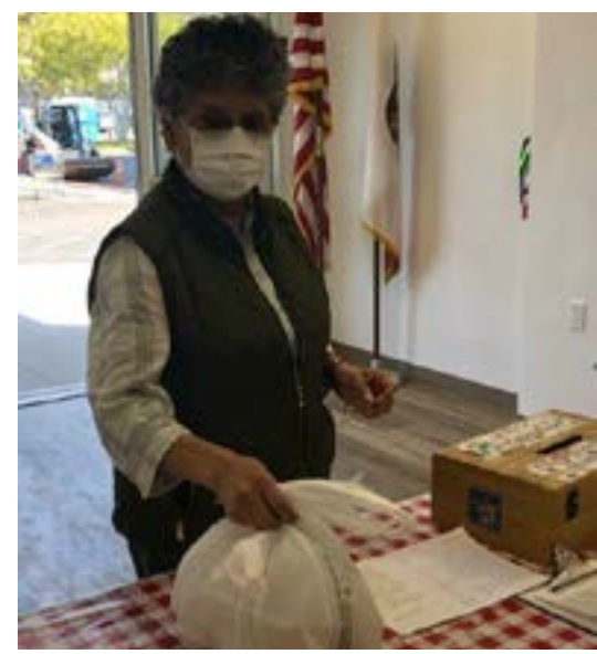
Grab and go lunches available at the nutrition center

During the COVID-19 pandemic Nutrition Center staff continue to provide nutritious meals to over 230 seniors through grab and go and home delivered meals. The George H. Waters Nutrition Center is open from 11:00 am and 12:30 pm and is located at 1415 D Avenue, National City. For more information call 619-336-6750 or email us at communityservices@nationalcityca.gov .