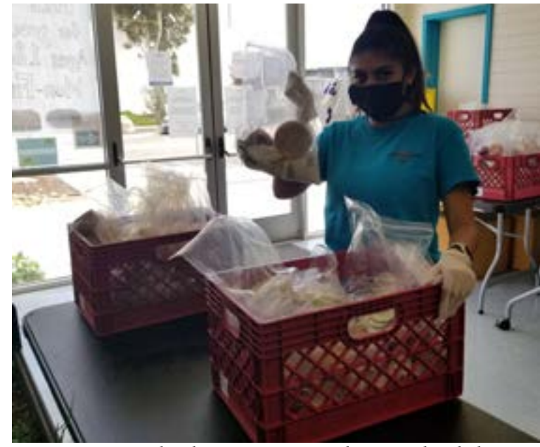
Emergency lunches are given to youth at Casa de Salud