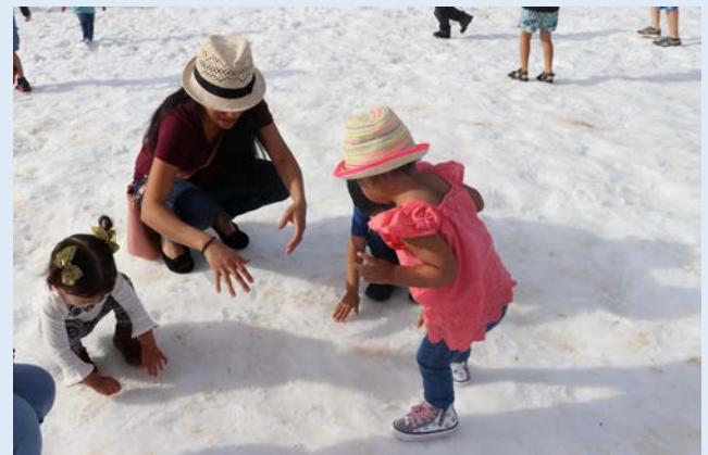
A Kimball Holiday 2017