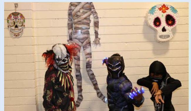
Casa de Salud Halloween Costume Contest 2018 Winners