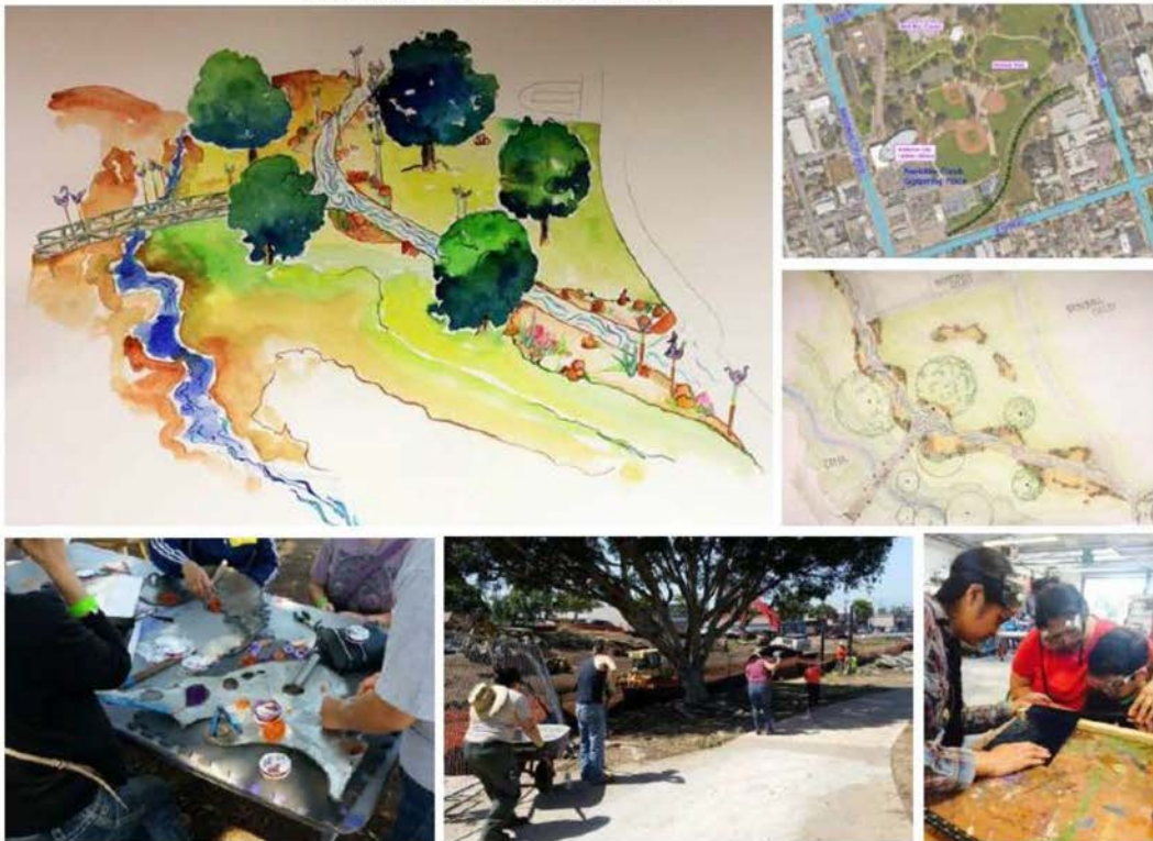
PARADISE CREEK EDUCATIONAL GATHERING PLACE